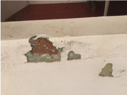
Entry/Exterior Taken : 11/10/2019 - 12:25