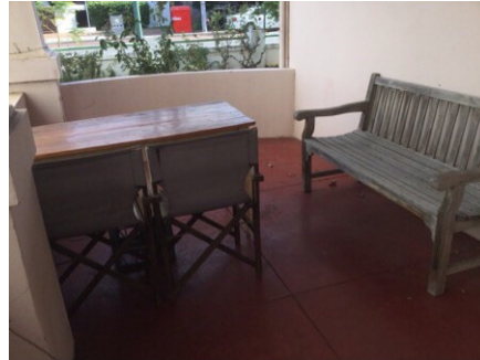
Kitchen/Meals Taken : 11/10/2019 - 13:32