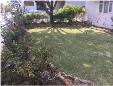
Front Gardens Taken : 11/10/2019 - 12:25