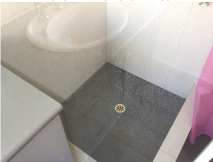
Bathroom 1 Taken : 11/10/2019 - 12:50