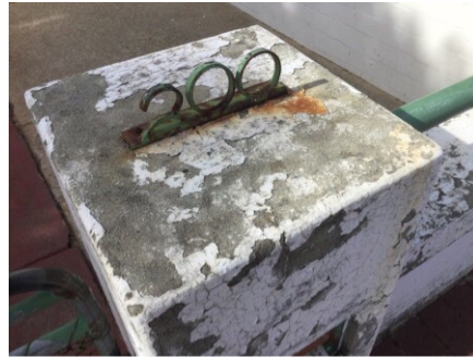
Rear Gardens Taken : 11/10/2019 - 12:25