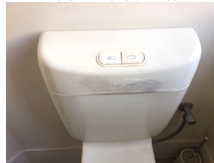
Our Summary Taken : 11/10/2019 - 13:32