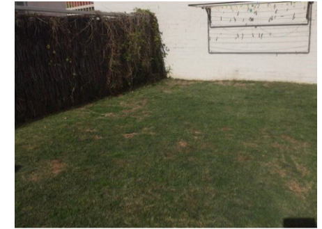
Entry/Exterior Taken : 11/10/2019 - 12:25