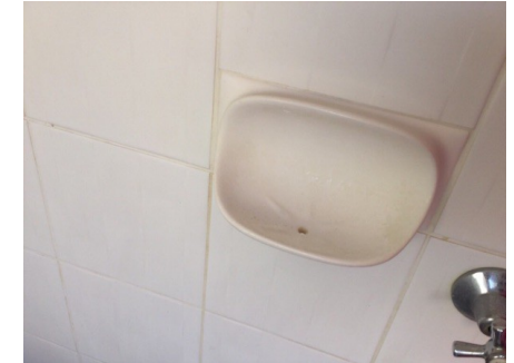
Bathroom 1 Taken : 11/10/2019 - 12:50