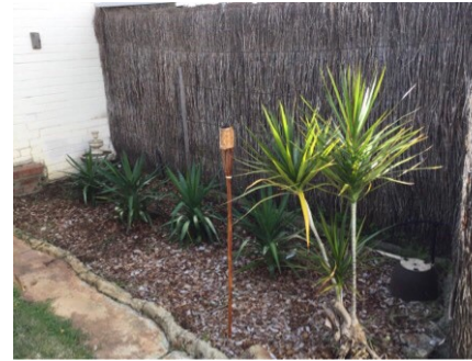
Rear Gardens Taken : 11/10/2019 - 12:25