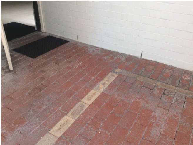
Patio Area Taken : 14/10/2019