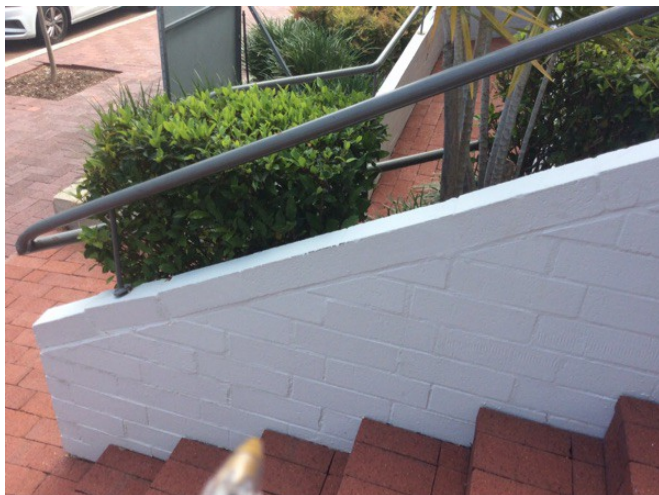
Front of Property Taken : 14/10/2019