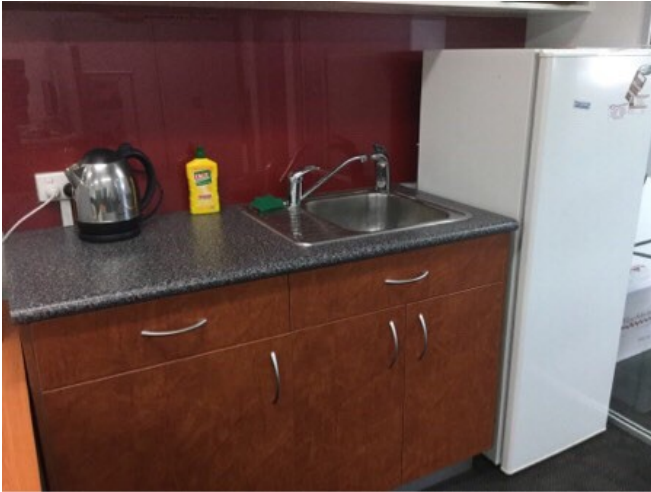
Kitchen/Meals Taken : 11/10/2019