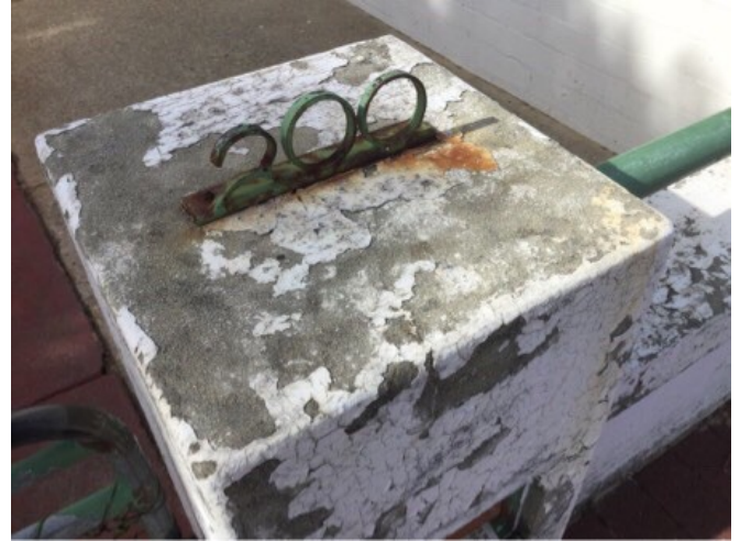
Front Gardens Taken : 11/10/2019