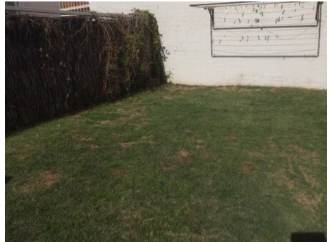
Rear Gardens Taken : 11/10/2019